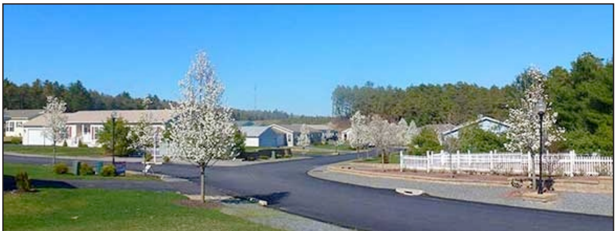
Photo of West Wood Village courtesy of community website