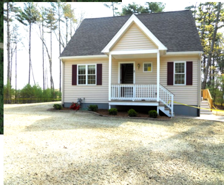
Sample idea of a Cape-style home.

We are getting closer to the groundbreaking for our next home on Brentwood Road in Kingston. The home will be a three bedroom, two bathroom cape style with a crawl space foundation. In order to accommodate those with physical disabilities, one bedroom and one full bathroom will be on the first floor, along with the living room, dining room and kitchen.