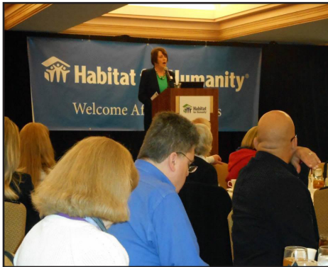
President and CEO for Habitat for Humanity of Jacksonville, Inc opened the conference updating all affiliates on our new strategic plan.

main focus on the Neighborhood Revitalization Initiative ("NRI") was a terrific stage on which to highlight HabiJax's revitalization of the New Town area of Jacksonville.