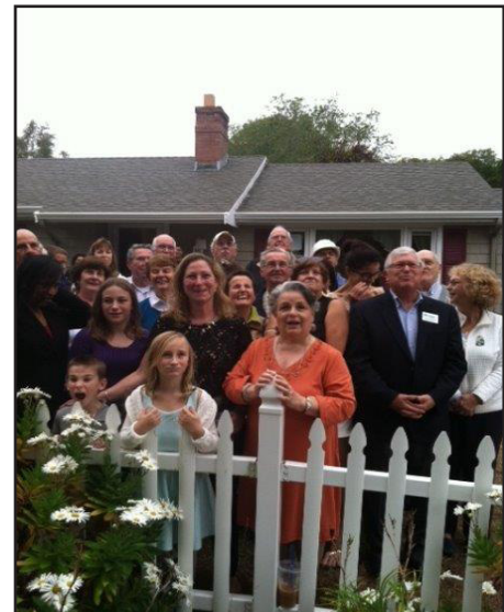
Revealing the home at the dedication ceremony.