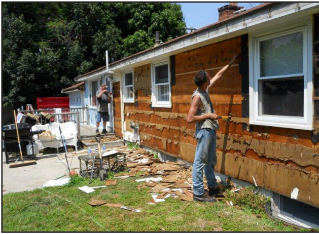
Finishing taking down the siding.