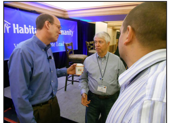
President and CEO for Habitat for Humanity of Jacksonville, Inc opened the conference updating all affiliates on our new strategic plan.

The local affiliate, Habitat of Jacksonville ("HabiJax") was honored by being chosen to host one of the Summits this year. One of the most successful Affiliates in the US, HabiJax has served over 7,500 families. The Summit's