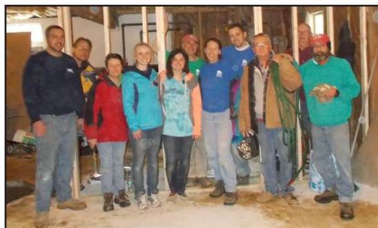
Photo of the volunteer crew.

Work continues as this newsletter goes to print. If you are interested in helping build on this or a future project, please register at www.hfhplymouth.volunteerhub.com or call the office at 508-866-4188.