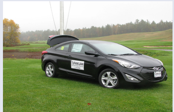
Last year's car donated by Tufankjian Hyundai of Plymouth for the Hole In One Contest.

Tickets for the tournament may be purchased at the Habitat office, 72 N. Main St. in Carver, or on our website, www.hfhplymouth.org . For more information on how to become a sponsor, please email our office at hfhplymouth1@verizon.net . All proceeds from the tournament go toward furthering Habitat's mission of providing simple, affordable housing in conjunction with a deserving family.