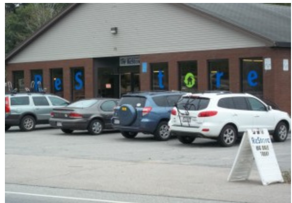
Habitat of Greater Plymouth's ReStore, located at 72 N. Main St. in Carver.

This generous donation will greatly enhance the presence and awareness of Habitat's ReStore, which sells new and used merchandise and building materials at discounted prices. All proceeds from the ReStore go toward the construction of new homes and toward Habitat's mission of helping deserving families achieve their dream of owning their own home.